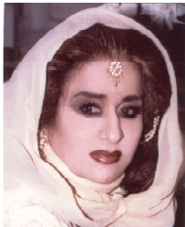
By: Shahnaz Husain

Ready to feel all fresh-faced and fabulous this spring?