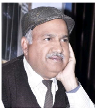
By: Vijay Garg

Revise each subject in a timely manner to avoid last-minute stress.